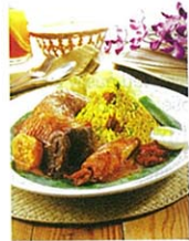
Super Rich Combo.